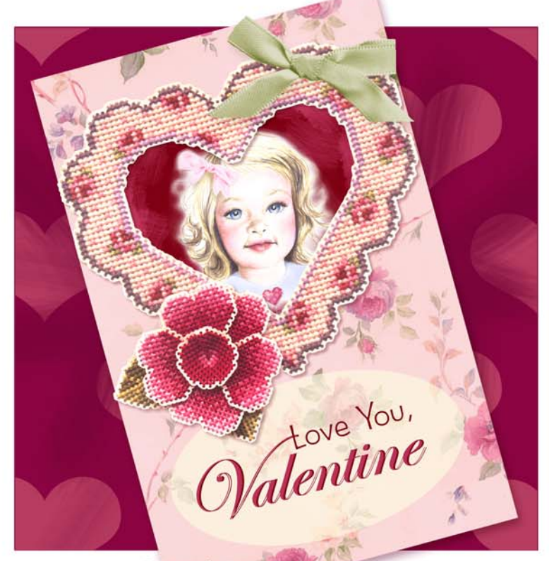
Copyright @ 2005 Brooke's Books Publishing

A complimentary cross stitch greeting card by Brooke Nolan