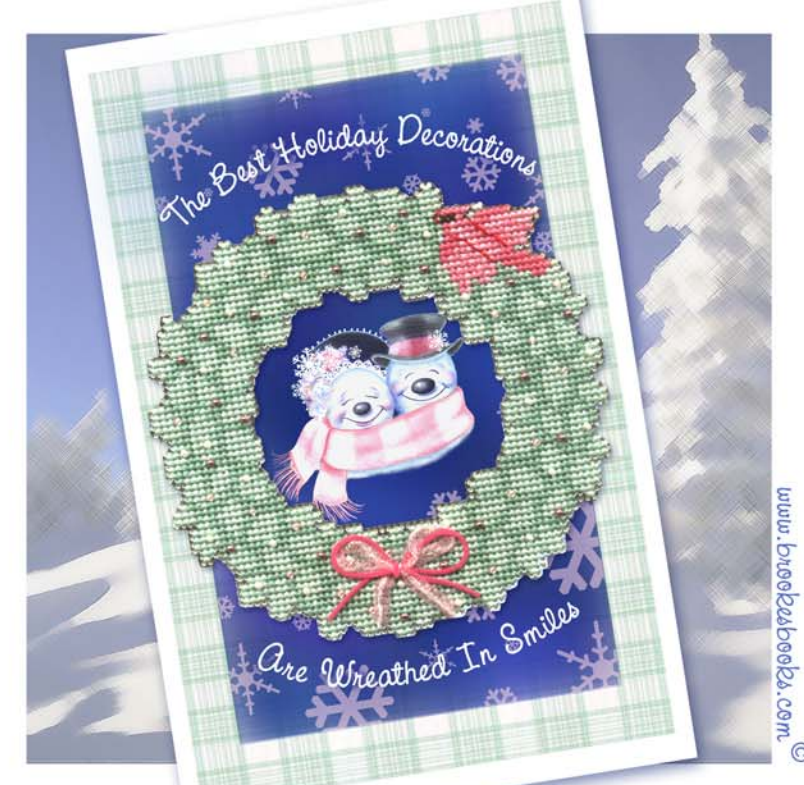
Copyright @ 2004 Brooke's Books Publishing

This design may be reproduced for newsletter or handout but may not be kitted or sold.