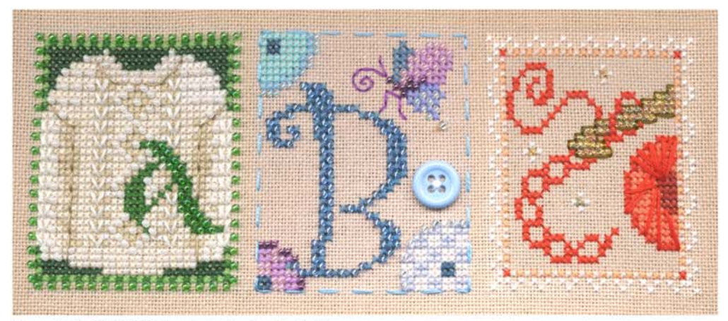
Copyright @ 2006 Brooke's Books Publishing

Complimentary Cross Stitch Designs by Brooke Nolan